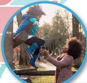
Easy access to early help