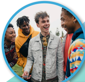
Dedicated Youth Hubs