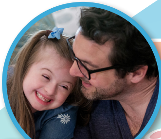
Groups and activities for all ages and needs