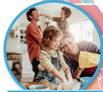
Whole family approach