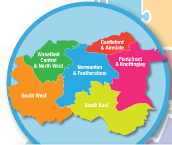
Locally based Family Hubs